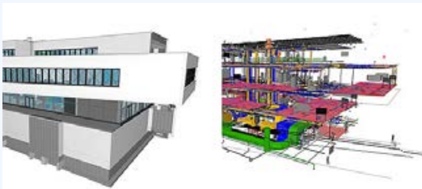
Fig. 4: The new Viega seminar center “Viega World” is integrally planned as a virtual model using the BIM methodology and was consistently mapped on the BIM models during realization. The picture on the top right shows exemplary models of the MEP installations.

Thanks to intelligently used heat inputs, photovoltaics on the roof and façade and on a neighbouring open area, as well as a local heating network with a neighbouring Viega production hall, “Viega World” generates more energy in the net primary energy balance than it requires during operation. Ulrich Zeppenfeldt: “For this purpose, for example, the most varied interrelationships between the facade design, i.e. the heat input to be achieved from it, and thermal comfort in the room, including the cooling requirement, were taken into account in advance via the integrated design according to BIM and incorporated into the detailed planning in an efficiency-optimizing manner.” “Viega World” is also a showcase model for the “Energy. Digital” research project sponsored by the German Federal Ministry of Economics and Climate Protection. Linked Data methods make it possible to visualize operating data live on an identical digital model in the future.