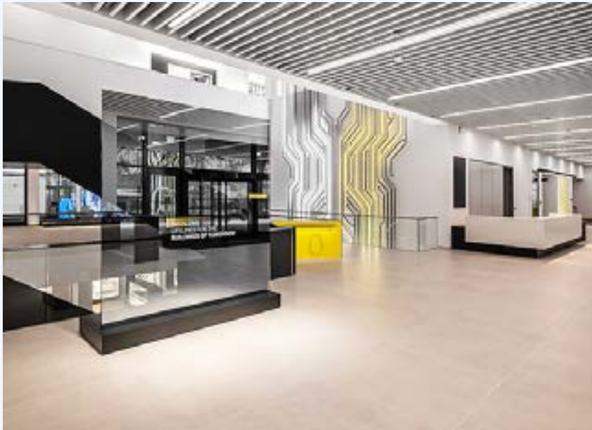
Fig.2: Viega World Foyer

The construction of “Viega World” became necessary because the existing seminar center with several thousand visitors per year repeatedly reached its capacity limits. The much-acclaimed new building now not only provides the urgently needed extension but also implements a highly modern didactic concept at the same time: The building itself is part of the educational content.