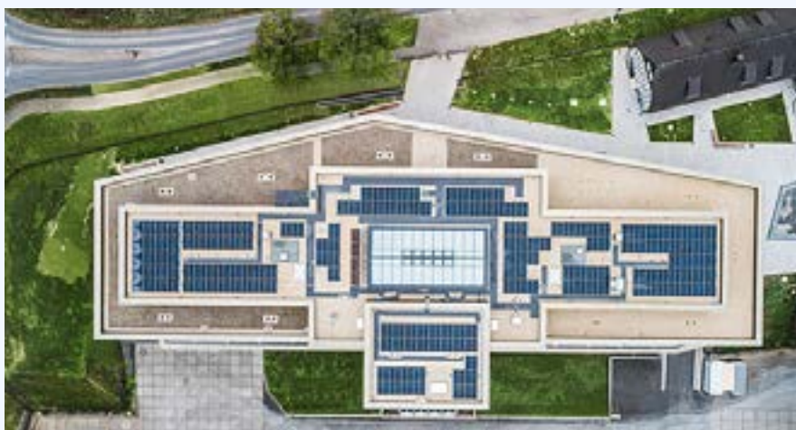
Fig. 3: An essential element of the regenerative energy supply of the “Viega World” is the approximately 2,700-square-meter PV system. In addition, there is a local heating concept, because the interactive training center is additionally connected to a neighboring Viega production hall in terms of heat technology.

Quote from Ulrich Zeppenfeldt, Vice President Global Service and Consulting at Viega and jointly responsible for the project: “With the topics potable water hygiene, energy efficiency and fire protection as well as the matching technical system solutions, Viega stands for a brand philosophy in building services equipment that is supported by practical relevance and future viability. During the new construction of the training center, we are documenting this through integrated design with the BIM working method and through an energy standard that is oriented to the highest standards in a resource-saving and sustainable manner. The ‘Viega World’ is thus the heart of the Viega brand, so to speak.”