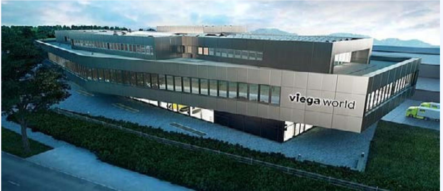
Fig. 1: The new Viega seminar center “Viega World” is integrally planned in the virtual model using the BIM working methodology.

System supplier Viega has created a Europe-wide reference project for the future of construction with the construction of a new interactive training center, the approximately 12,000-square-meter “Viega World” at its site in Attendorn-Ennest.